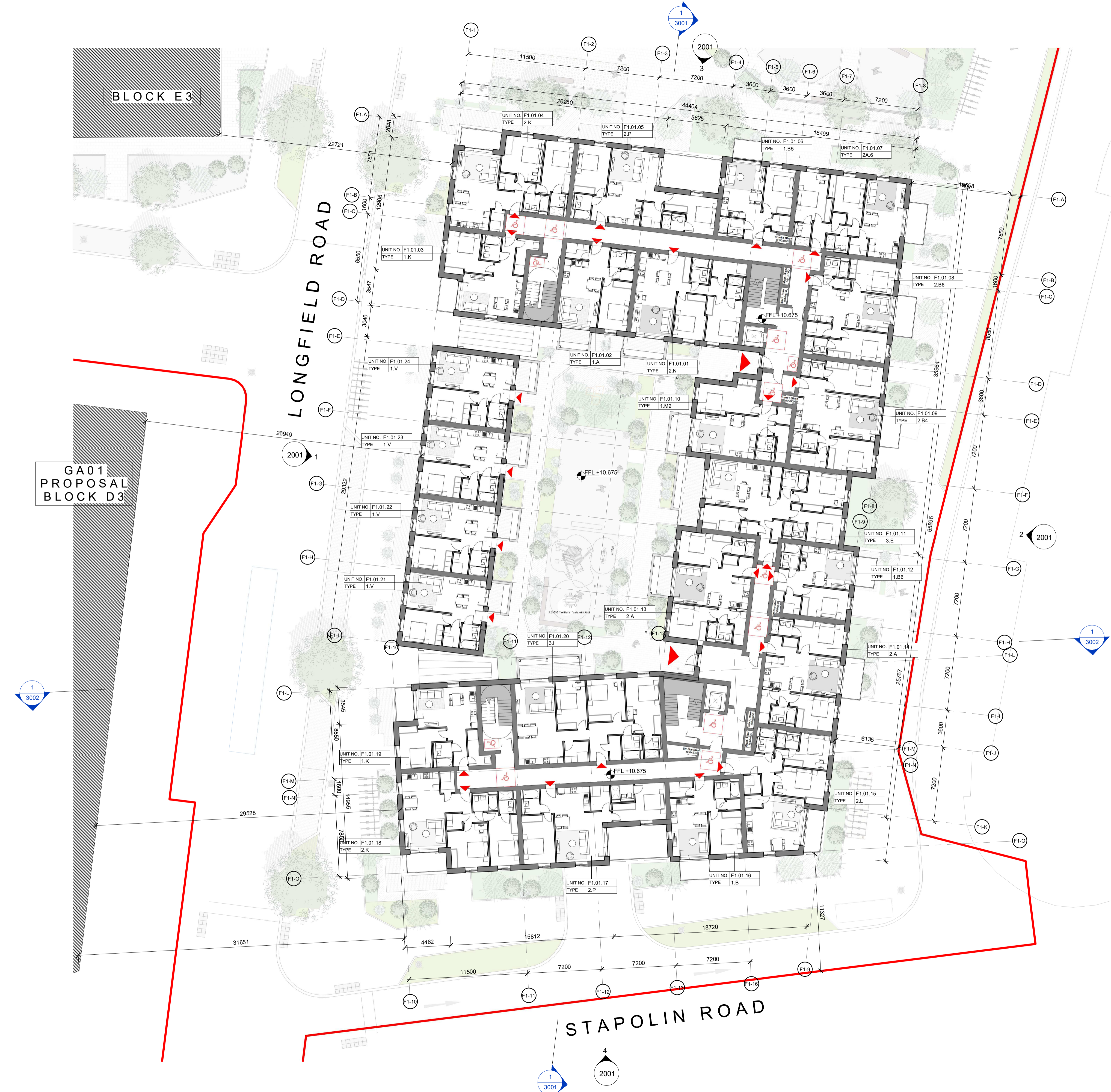
① L01 - FIRST FLOOR PLAN 1:200 0 4 8 12 16 20m

Henry J Lyons Architecture + Interiors henrylyons.com +353 1 888 3333 info@henrylyons.com 51-54 Pearse Street Dublin D02 KA66